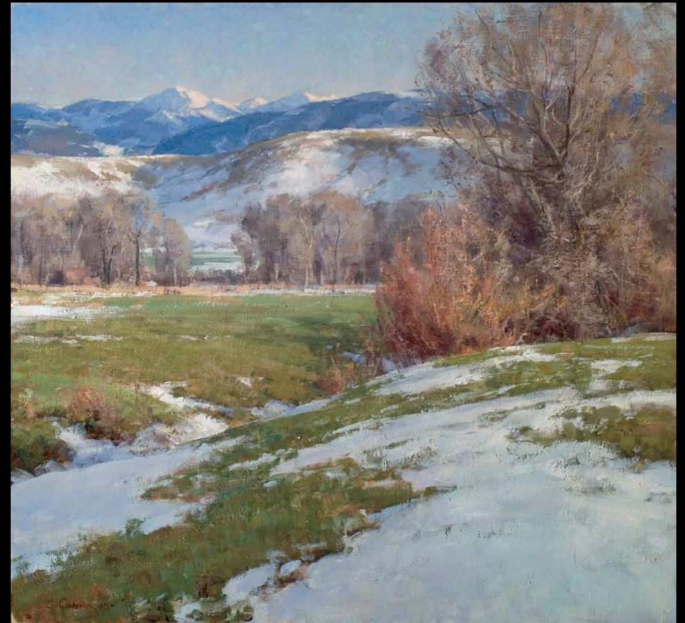
Winter Release Oil on Canvas | 28 x 30 inches